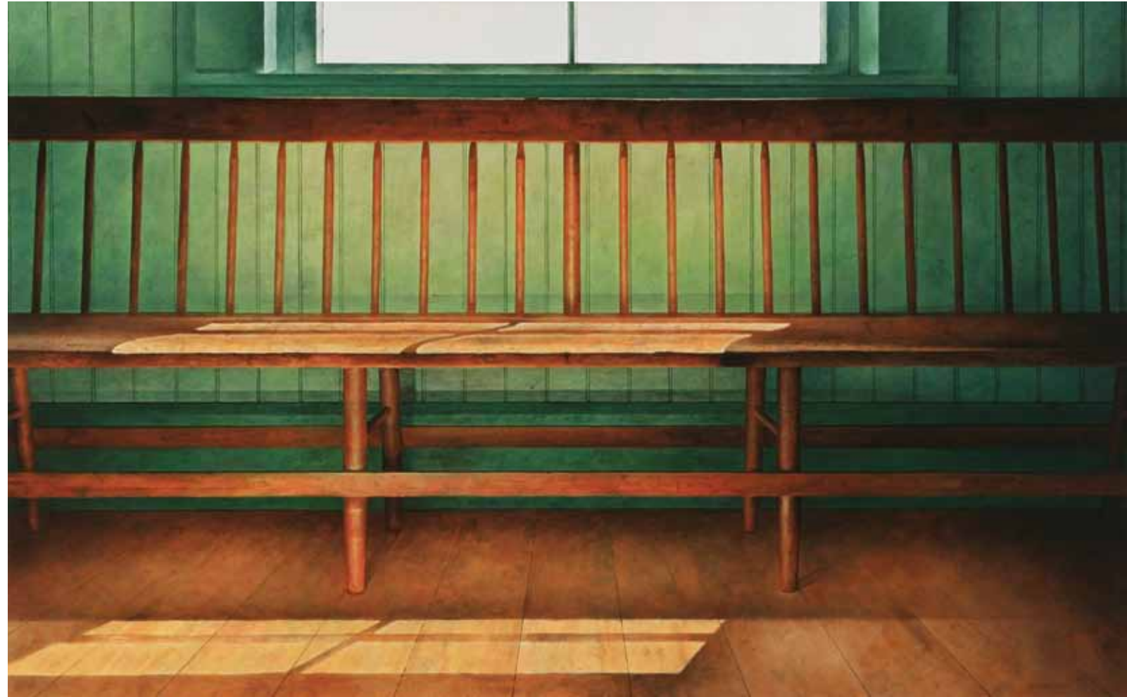
THE SILENT VISITOR acrylic on panel, 32 x 52 in.