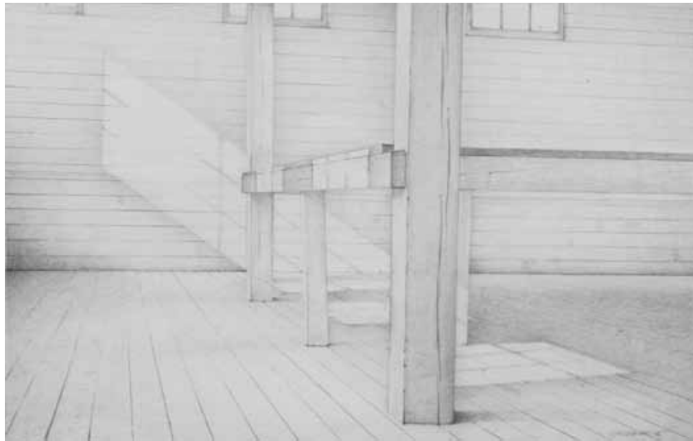
THE LAST EXHIBITOR graphite on stonehenge paper, 12 x 19 in.