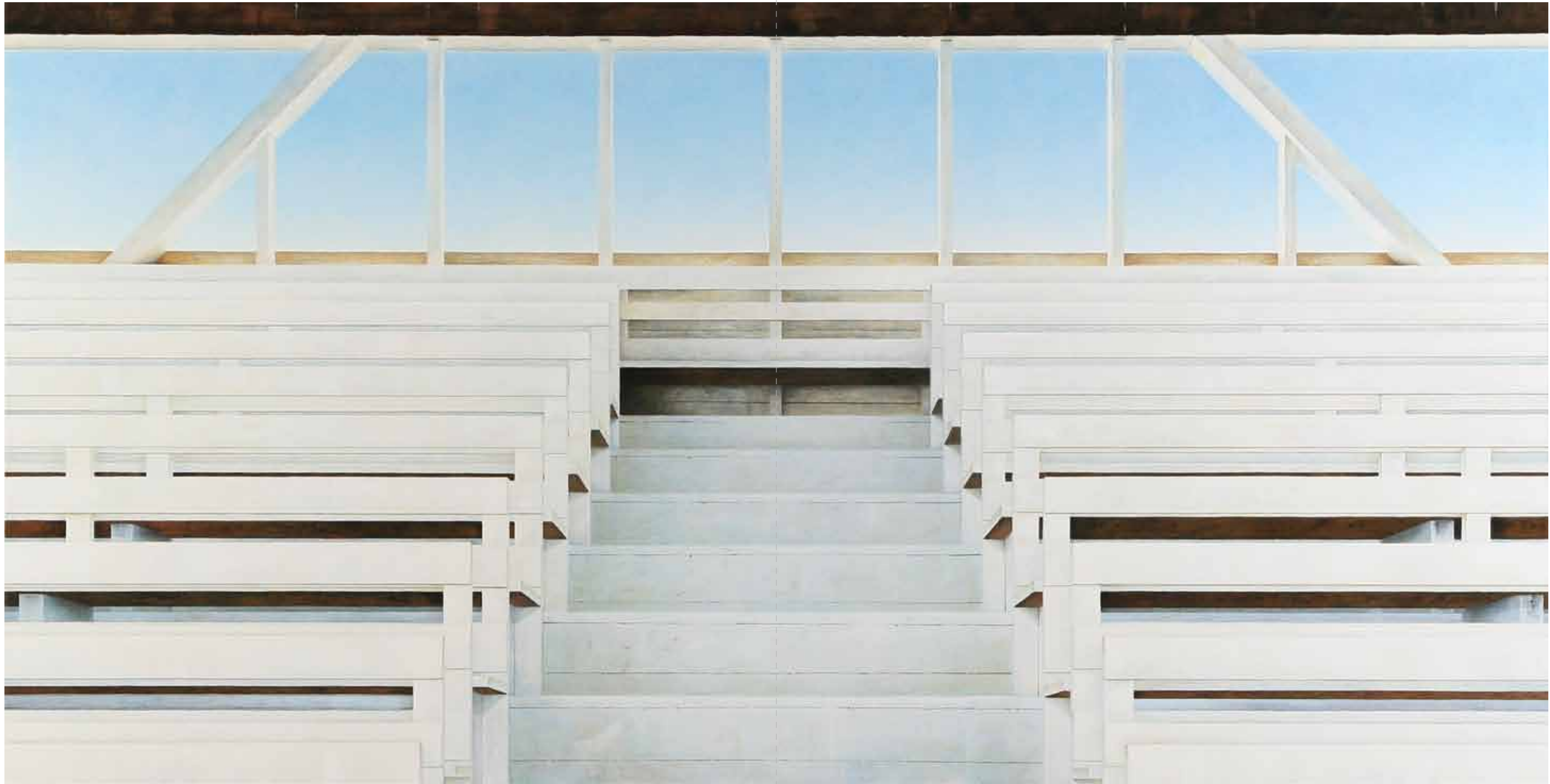
FRONT ROW CENTER acrylic on panel, 35 x 71 in.