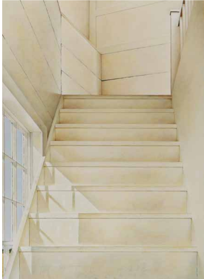
NORTH STAIRS acrylic on panel, 39 x 27 in.