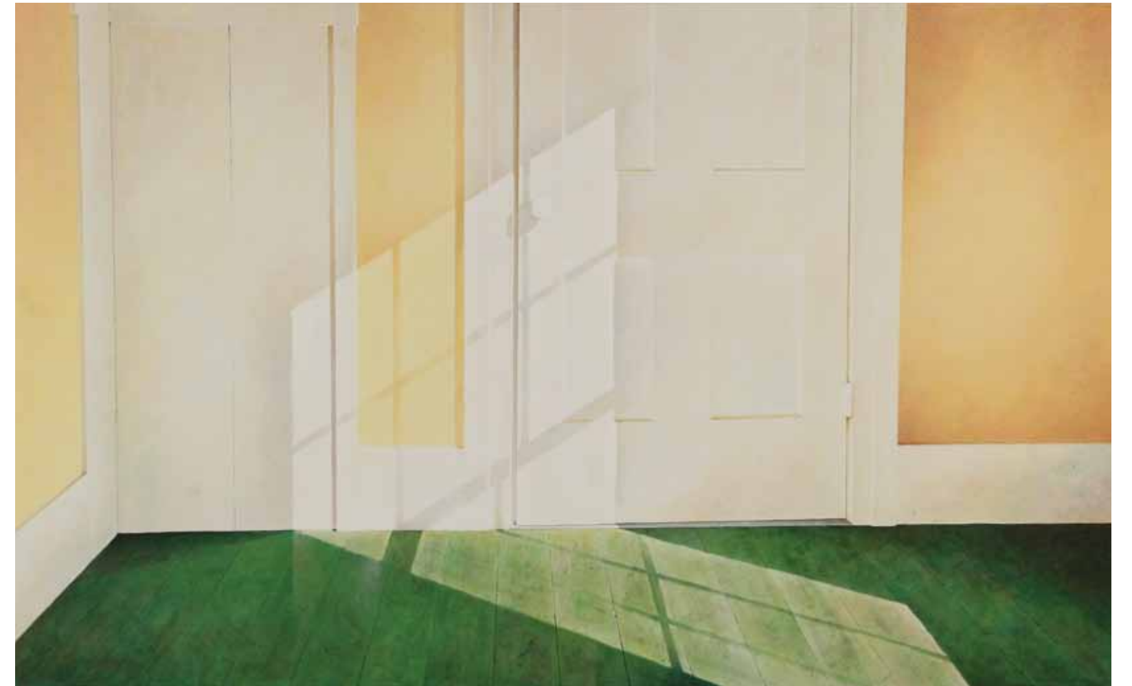
LATE SUNDAY MORNING acrylic on panel, 30 x 48 in.