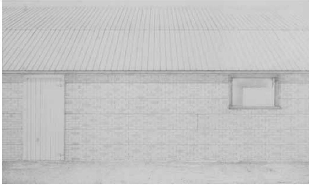
THE CURLING CLUB graphite on stonehenge paper, 15 x 25 in.