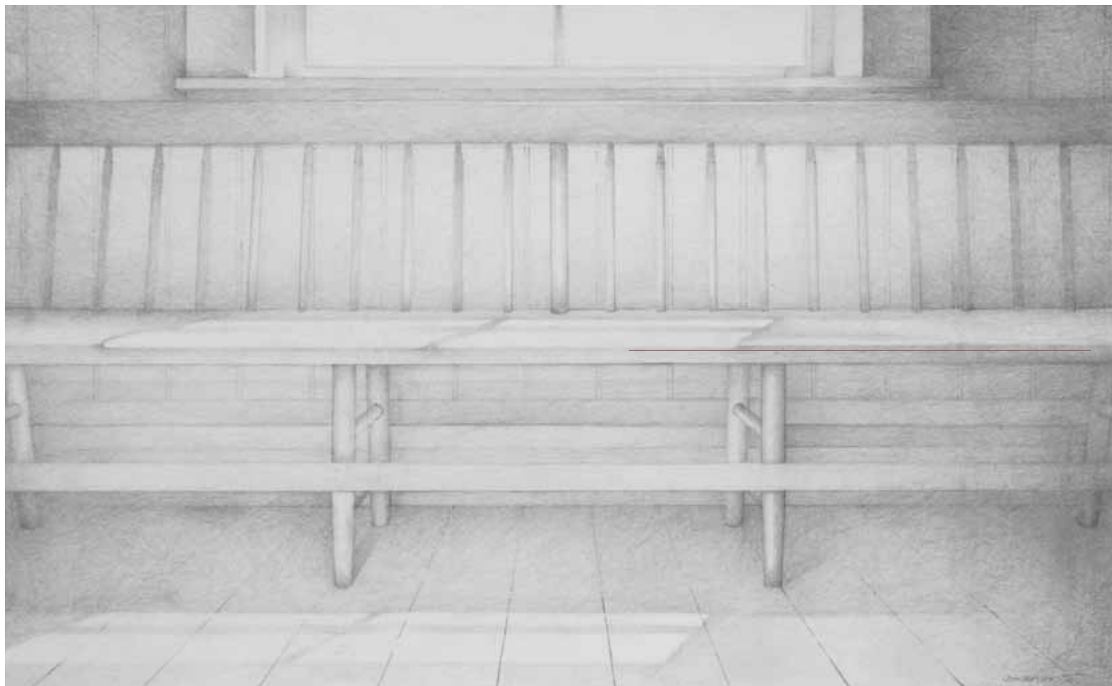
Above: THE SILENT VISITOR, graphite on stonehenge paper, 16 x 26 in. Front Cover: THE LAST EXHIBITOR, acrylic on panel, 30 x 48 in.