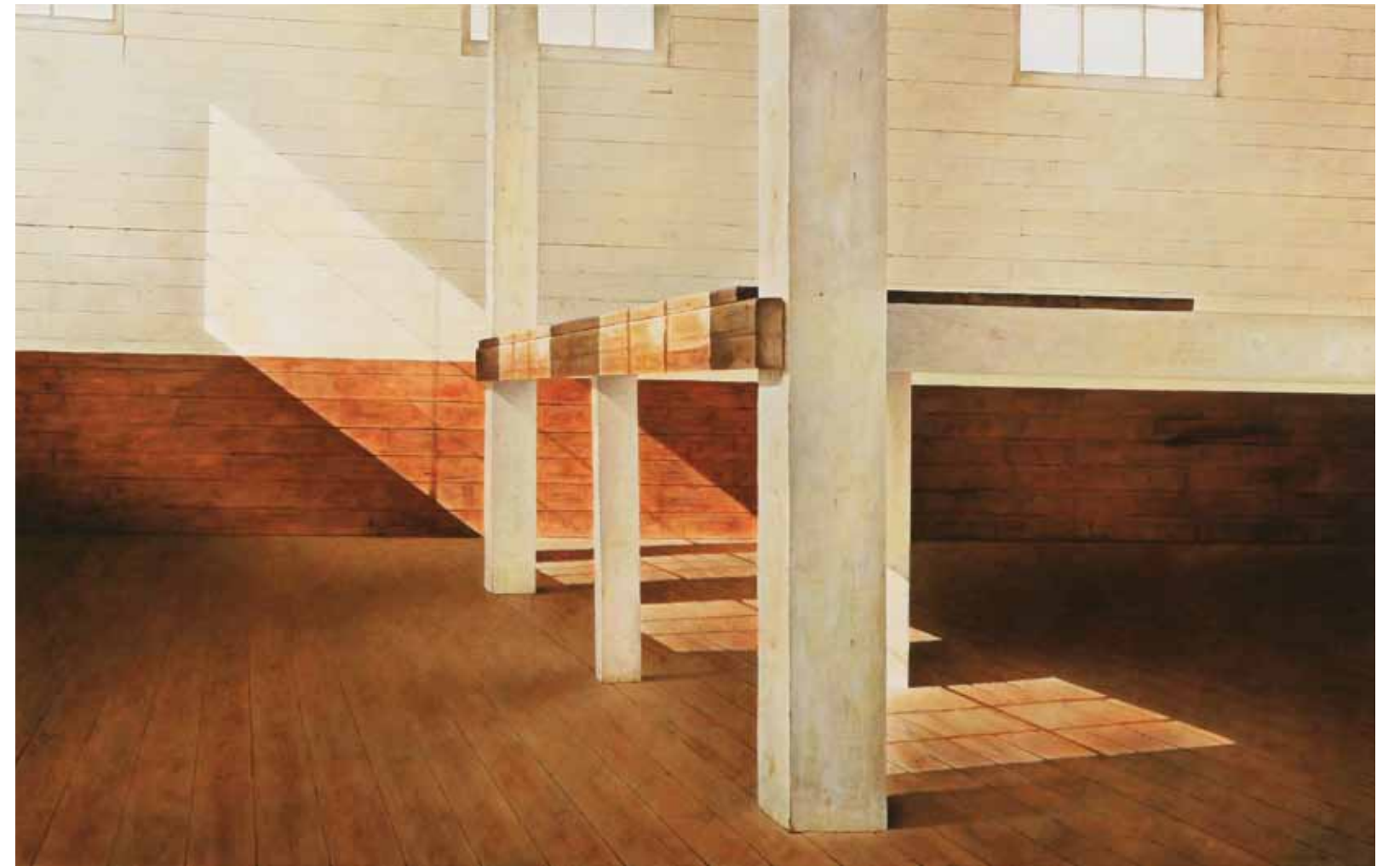
THE LAST EXHIBITOR acrylic on panel, 30 x 48 in.