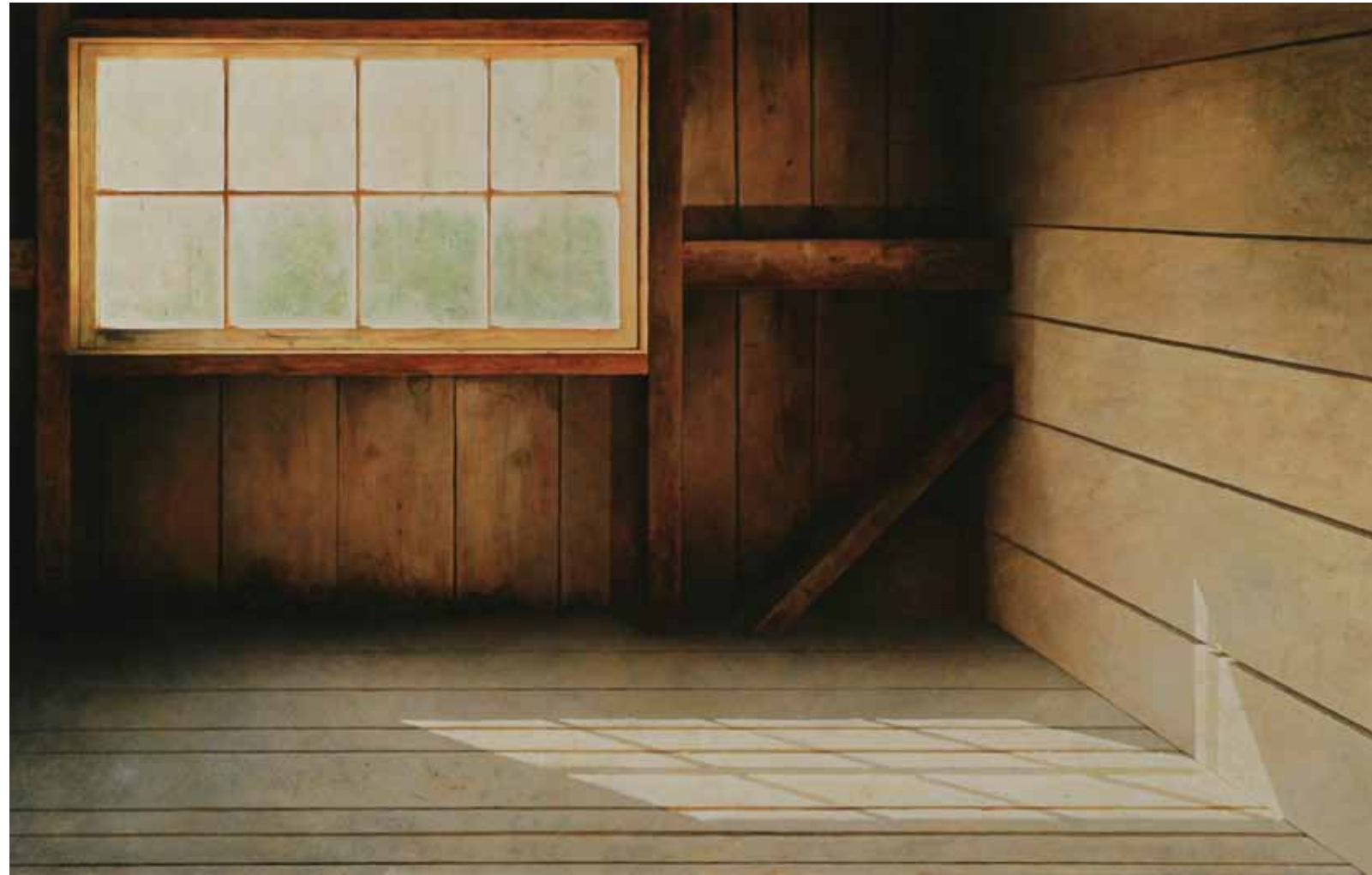
UNDER THE LOFT acrylic on panel, 26 x 40 in.