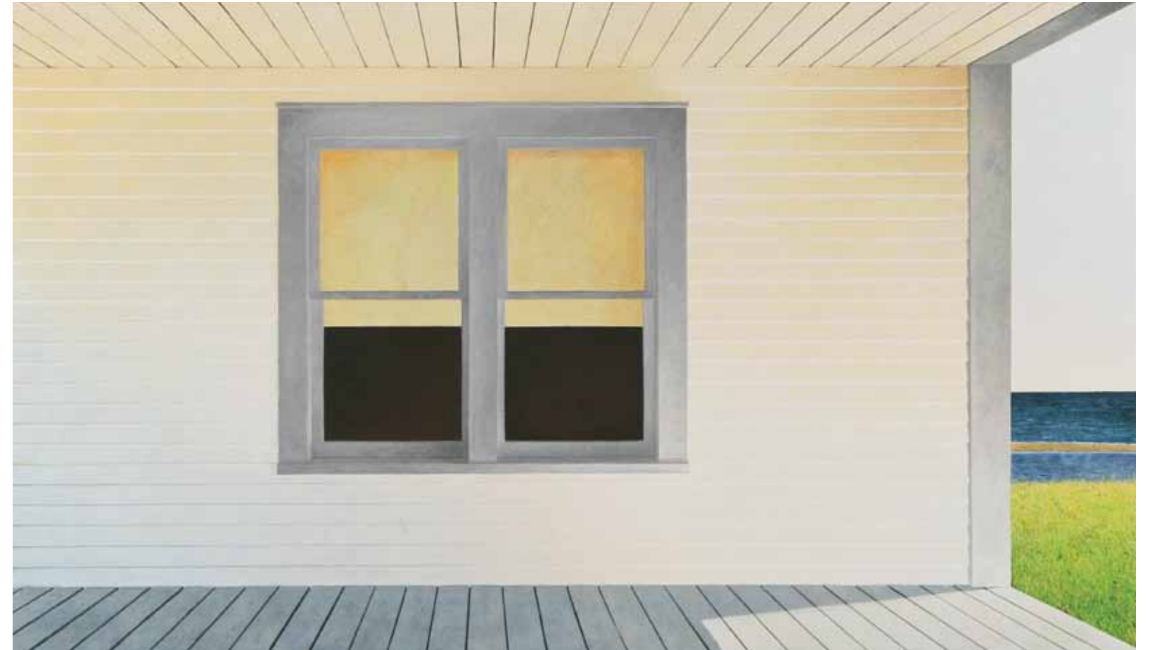
THE CAPTAIN'S HOUSE acrylic on panel, 25 x 44 in.