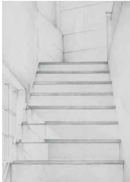
NORTH STAIRS graphite on stonehenge paper 16 x 11 in.