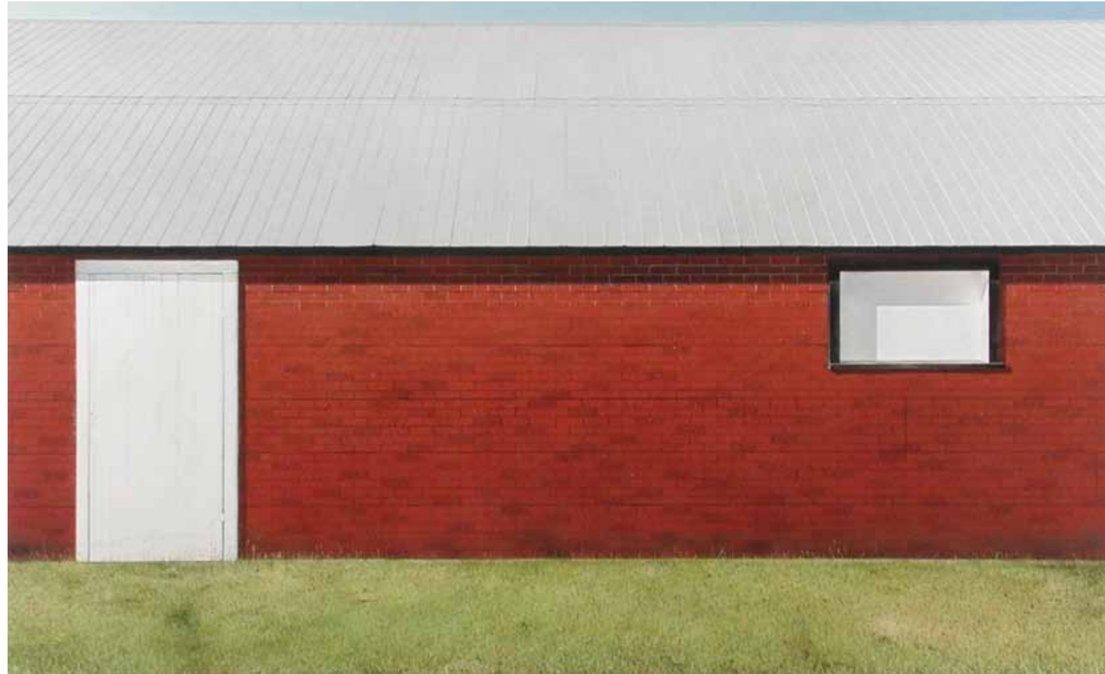
THE CURLING CLUB acrylic on panel, 29 x 48 in.