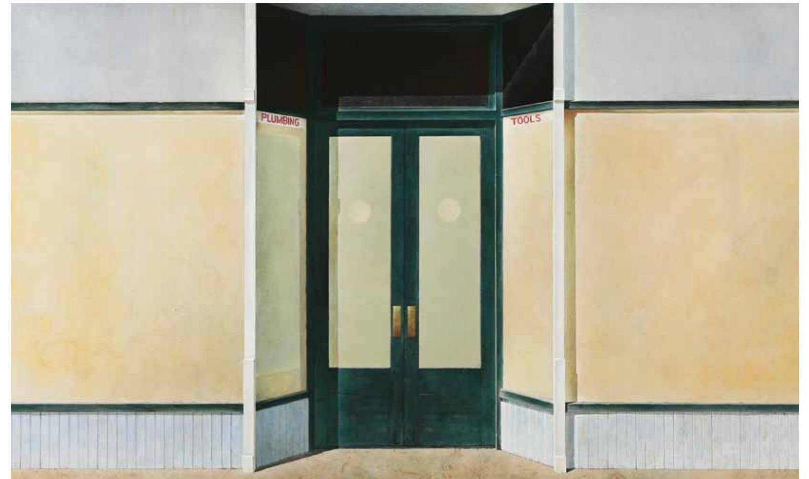
PLUMBING TOOLS acrylic on panel, 28 x 47 in.